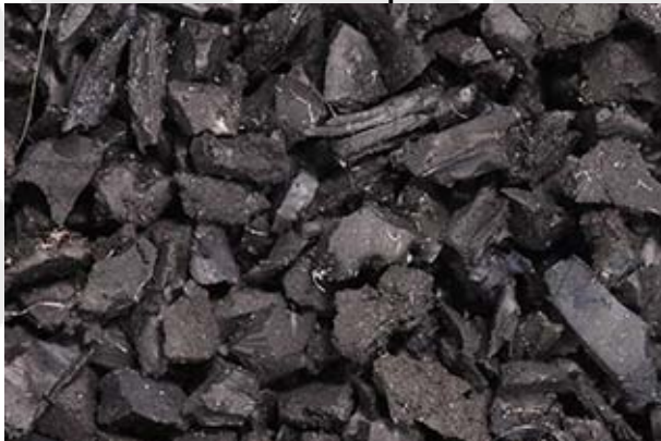
Before UVA exposure