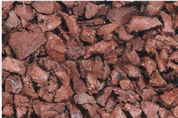
Before UVA exposure